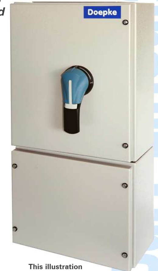
This illustration shows a DS-3250 with an EX03 spreader box attached.